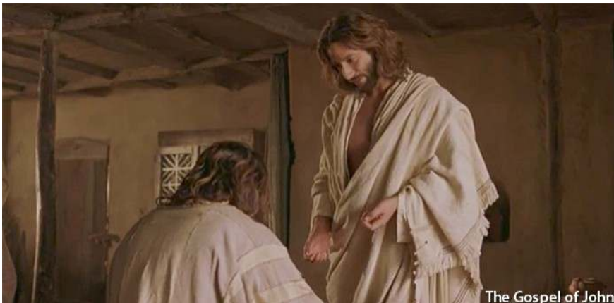
The Gospel of John